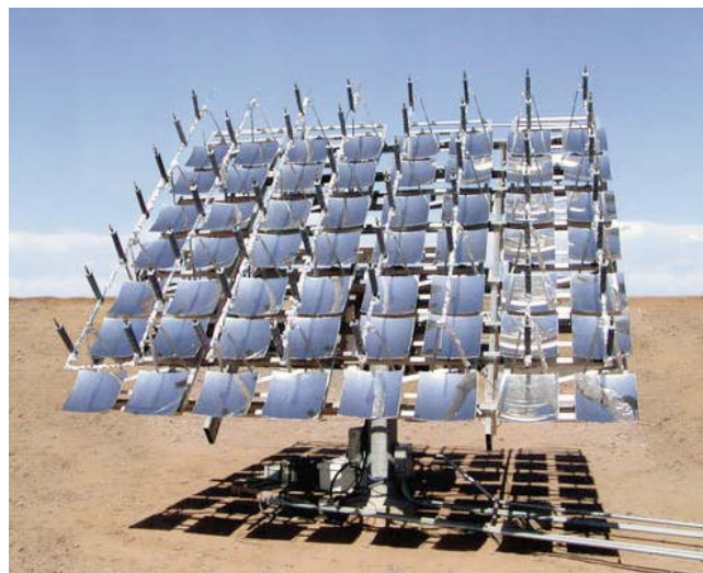
Arizona Public Service

For more information, visit: www.nwf.org/globalwarming .