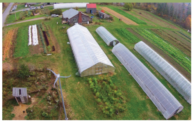
Aerial view of the Beech Hill Farm, owned by College of the Atlantic.

The College of the Atlantic, located along the coast in Bar Harbor, owns 300 acres of nearby farmland and forests used for research, education, and conservation opportunities for students. Properties include Beech Hill Farm, which is 15 miles west of campus near the town of Mt. Desert. Beech Hill is a working farm that provides organic vegetables and heirloom apples for college dining halls. Of its 73 acres, 67 are forested. Closer to campus, the 125-acre Peggy Rockefeller Farms, which raises organic produce as well as cows, sheep, and chickens, includes 62 acres of forest and wetlands. Both farms use border plantings along fields that serve as wildlife habitat, attractants for beneficial insects, and runoff control. A 100-acre pristine woodland, the Cox Protectorate, is near the Rockefeller Farms. In 2010-11, a Farms Task Force reviewed the history and land-use capacity of COA's remote properties and developed a set of goals. A top priority was to increase support for student educational connections. All three sites are currently used for independent and group studies, senior thesis projects, and research on the Northeast Creek watershed.