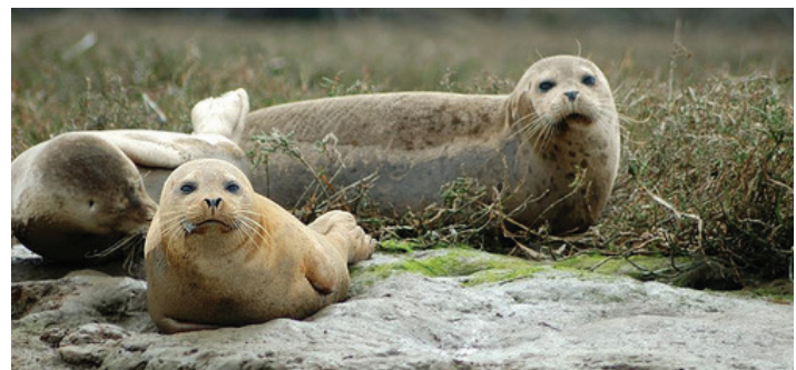
In the U.S., harbor seals are found along the coasts of the north Atlantic and Pacific Oceans.

COA also owns 12 acres of the 220-acre Great Duck Island, which it shares with The Nature Conservancy and the State of Maine. The college property, named the Alice Eno Field Research Station, hosts teams of students and faculty who study the island's nesting colonies of Leach's storm petrels, black guillemots, black-backed gulls, and other seabirds and raptors. The college also owns Mount Desert Rock, located 25 miles offshore, which is a fully operational marine mammal research station where students carry out research projects involving humpback and northern right whales, harbor seals, white-sided dolphins, and other species. And in the literal backyard of the Bar Harbor campus itself, Acadia National Park's 30,000 acres offer further opportunities for recreation and outdoor study. Among other projects, students helped with the reintroduction of peregrine falcons to the park 30 years ago and with surveys of Acadia's birds and other wildlife.