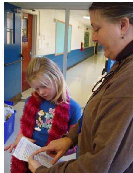
A student gets help from her teacher how to keep record of recycling volume

Key Stakeholders for school recycling programs will mostly come from three main organizations: the school board, a local solid waste department and the solid waste/recycling hauler. It is a good idea to get a representative from relevant groups or any organization that can bring value to your program, such as educational services, promotion, etc.