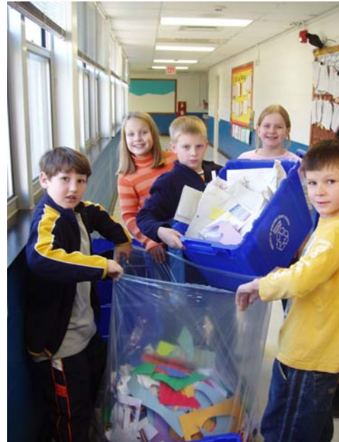
Students at Bell Elementary, Asheville, have an active and essential role in the recycling program

Implementing school recycling programs also supports lessons on environmental stewardship and conservation taught in science and social studies curricula. By implementing recycling programs, schools become a hands-on learning environment where students learn to practice the behaviors of environmental stewardship and good citizenship by reducing waste and participating in a recycling program.