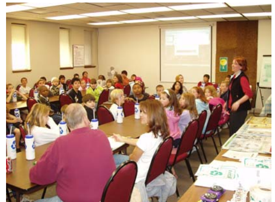
Polk County teachers and students participate in a workshop about recycling at Land-of-Sky Regional Council, 2006