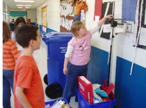
Students use a basic scale to calculate the school's total paper recovery

A school recycling program can be a great opportunity to enhance student leadership and school pride. Making the program isn't difficult; kids naturally enjoy recycling programs when they are involved with collection and making sure everything runs smoothly. Young people respond amazingly well to having a job responsibility and performing it if they believe they're doing a good thing. Recycling programs at schools frequently fall into this category.