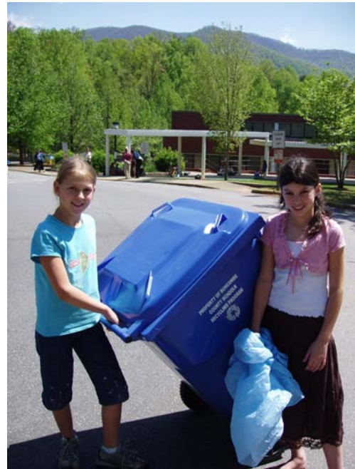
Recyclers like their job!