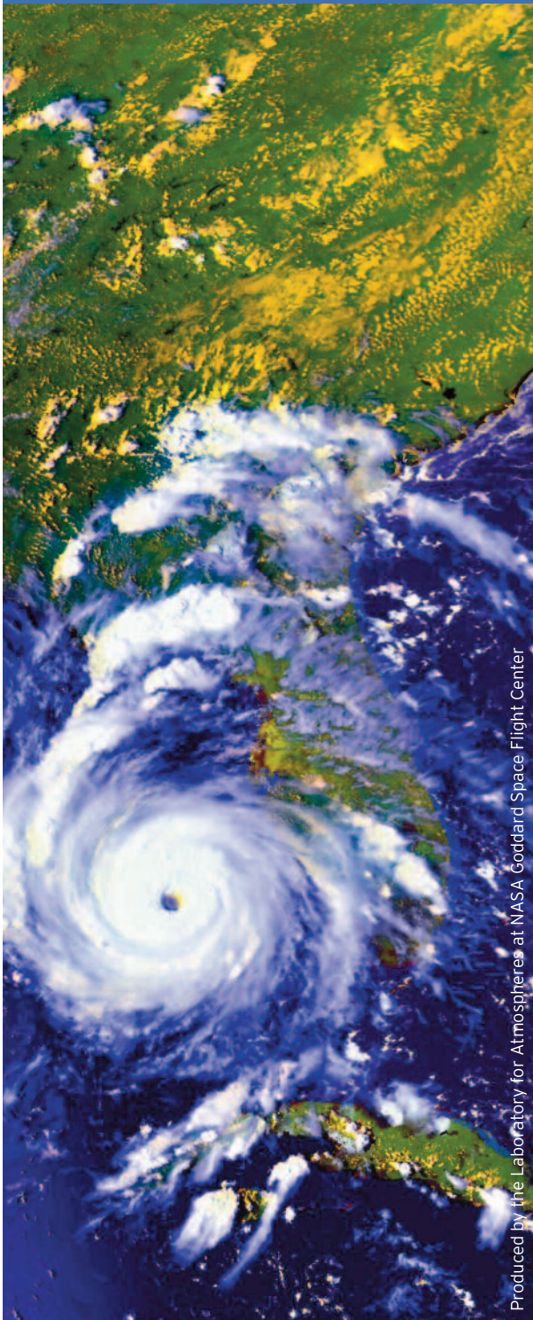
Produced by the Laboratory for Atmospheres at NASA Goddard Space Flight Center

Stronger hurricanes, heavier rainfall, and rising sea level: this is what global warming has in store for the U.S. Gulf and Atlantic coasts. The latest science indicates that hurricane wind speed will increase 2 to 13 percent and rainfall rates will increase 10 to 31 percent over this century. At the same time, sea-level rise will cause bigger storm surges and further erode the natural defenses provided by coastal wetlands that buffer storm impacts.