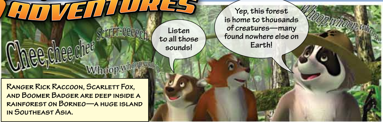
RANGER RICK RACCOON, SCARLETT FOX, AND BOOMER BADGER ARE DEEP INSIDE A RAINFOREST ON BORNEO—A HUGE ISLAND IN SOUTHEAST ASIA.

Listen to all those sounds! Yep, this forest is home to thousands of creatures—many found nowhere else on Earth!