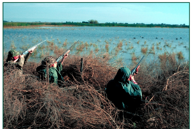
Wetland restoration will provide increased sportsmen opportunities along the river.