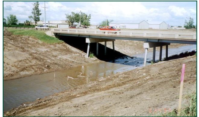
Band-Aid: A similar Corps ditch. The Red River project actually requires a 36-mile-long channel, 100-300 feet in width, with a maximum depth of 29 feet.

Wetland restoration is another option that must be examined. Wetland drainage in the Red River Basin has been occurring continuously for more than a century. More than 85% of the wetlands in the Minnesota portion of the Basin have been drained and significant wetland destruction has also occurred in North and South Dakota. In Minnesota alone, more than 28,000 miles of ditches