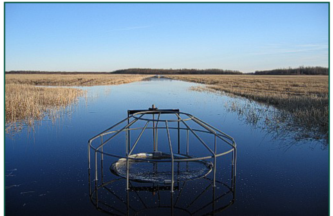
Solution: Agassiz Field Trial Site at Full Storage.