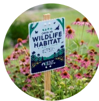
Stake or Signpost