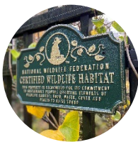
Fence or Gate

Many certifiers choose the following locations for their sign: