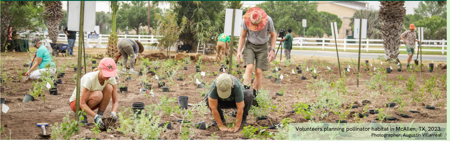
Volunteers planting pollinator habitat in McAllen, TX, 2023.