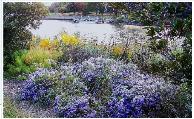
Northern Neck Master Gardeners

In addition to working directly with interested waterfront property owners, Shoreline Evaluation Volunteers lead public outreach efforts, such as educational seminars and speaking to community organizations, regarding erosion control methods.