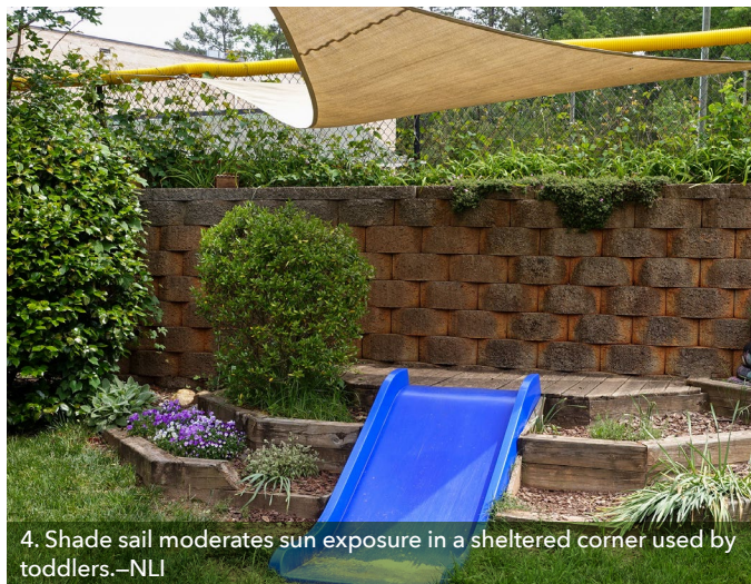
4. Shade sail moderates sun exposure in a sheltered corner used by toddlers.—NLI

Shade/rain cover. While sunlight can play an important role in deactivating the virus that causes COVID-19, over-exposure to UV rays is itself a health risk. Sun must be balanced with shade, which is crucial for summer comfort. Balance can be created with scattered patches of shade that protect children, while allowing sun to penetrate. Although tree planting is a long-term shade solution with added educational value, during the pandemic, a mix of shade sails, tents, umbrellas, pergolas, arbors, and roof structures can provide protection from sun, rain, and wind (4, 7).