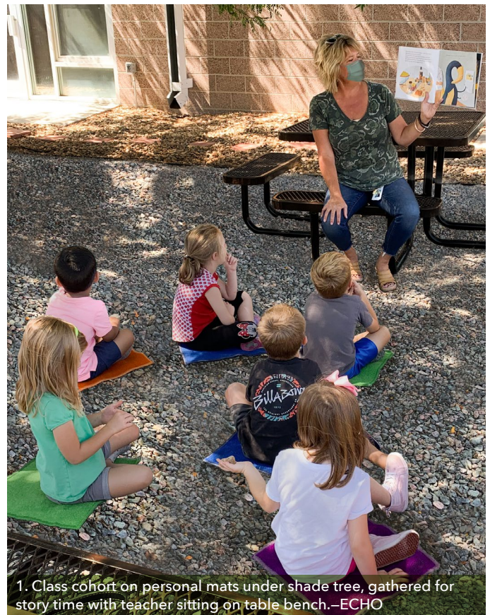
1. Class cohort on personal mats under shade tree, gathered for story time with teacher sitting on table bench.

establishing stable groups of children and adult(s), called cohorts. This approach aims to prevent mixing between groups while allowing for social interaction within groups. It can be combined with time outdoors adhering to local or state guidelines for personal protective equipment and sanitation (1).