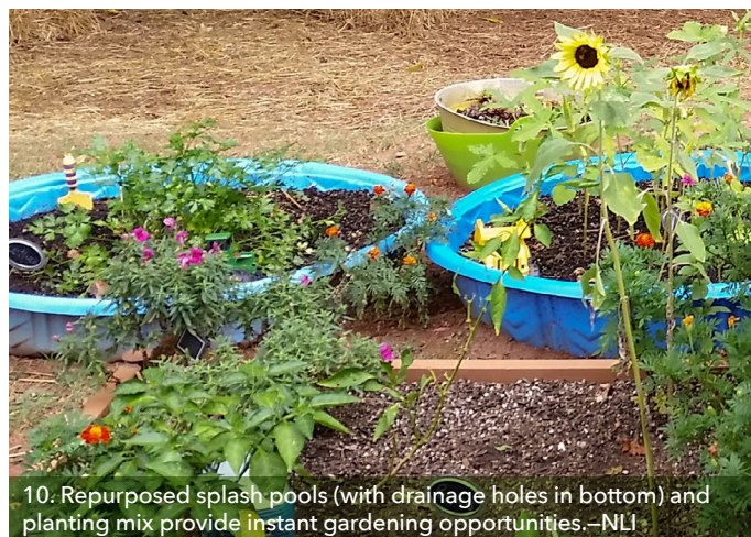
10. Repurposed splash pools (with drainage holes in bottom) and planting mix provide instant gardening opportunities.

Disclaimer: The Natural Learning Initiative (NLI), NC State University, the National Wildlife Federation, their partners, and supporting entities assume no responsibility for consequences arising from physical interventions using information contained in this document. Under no circumstances will liability be assumed for any loss or damage, including without limitation, indirect or consequential, incurred during installation, management, and use of such interventions. Highly recommended is adherence to relevant local, state, and national regulatory requirements concerning but not limited to health and safety, accessibility, licensing, and program regulation.