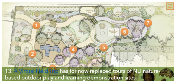
13. A Virtual Field Trip has for now replaced tours of NLI nature-based outdoor play and learning demonstration sites.