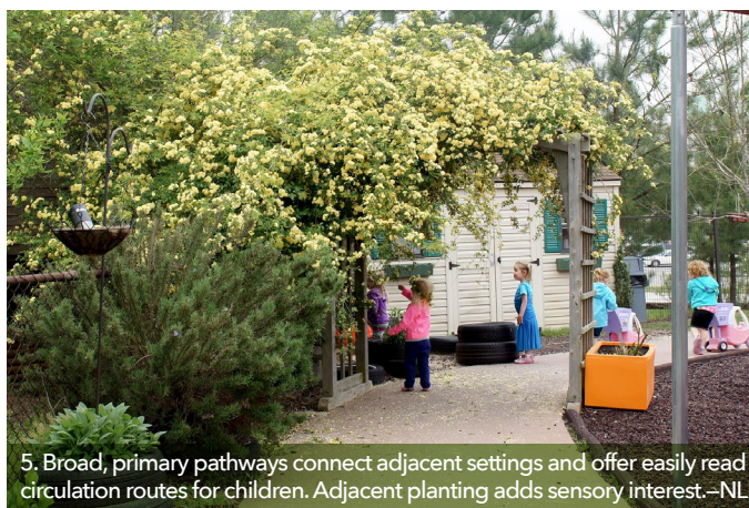
5. Broad, primary pathways connect adjacent settings and offer easily read circulation routes for children. Adjacent planting adds sensory interest.—NLI