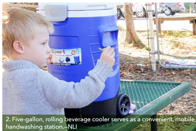
2. Five-gallon, rolling beverage cooler serves as a convenient, mobile, handwashing station.—NLI