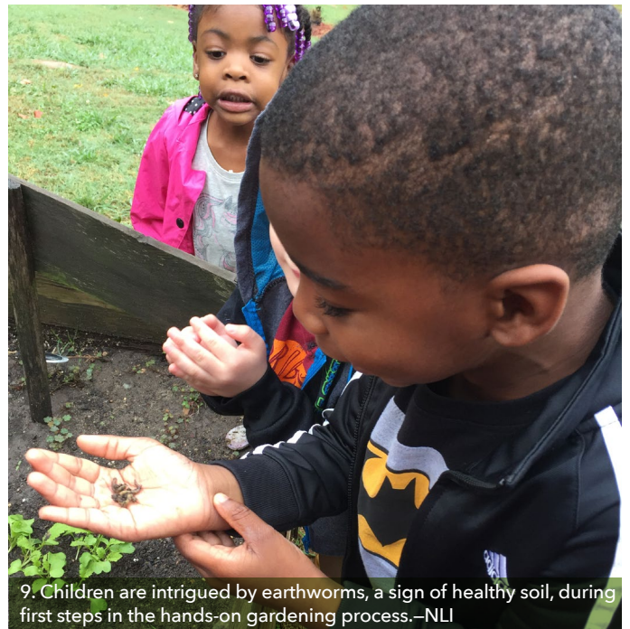
9. Children are intrigued by earthworms, a sign of healthy soil, during first steps in the hands-on gardening process. –NLI