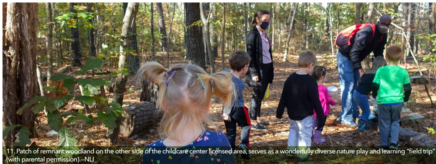
11. Patch of remnant woodland on the other side of the childcare center licensed area, serves as a wonderfully diverse nature play and learning "field trip" (with parental permission).—NLI