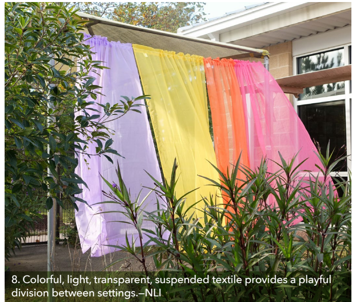
8. Colorful, light, transparent, suspended textile provides a playful division between settings. –NLI

Repurposing closed areas. If playground equipment use is not allowed during COVID-19, parts of the setting may be used while still following the rules. Settings with movable features and large use-zones, like swings, may be repurposed for other activities once swing seats have