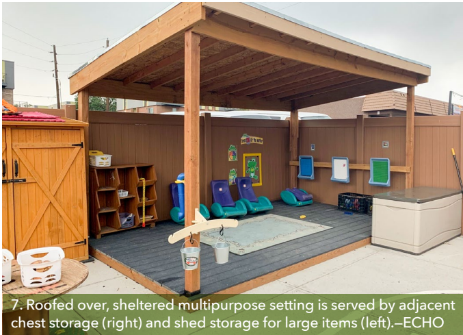
7. Roofed over, sheltered multipurpose setting is served by adjacent chest storage (right) and shed storage for large items (left). –ECHO