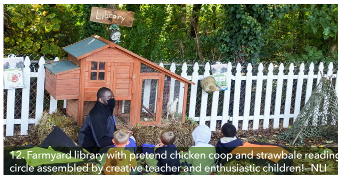
12. Farmyard library with pretend chicken coop and strawbale reading circle assembled by creative teacher and enthusiastic children!—NLI

Innovative play and learning programming can help providers engage children in new outdoor settings for longer periods of time (12). Especially in response to COVID-19, providers may benefit from supportive training, tools, and resources to encourage spending more enjoyable time outside during a substantial part of the day. Online professional development support such as webinars, trainings, and networks of practitioners are available through ECHO and NLI (13).