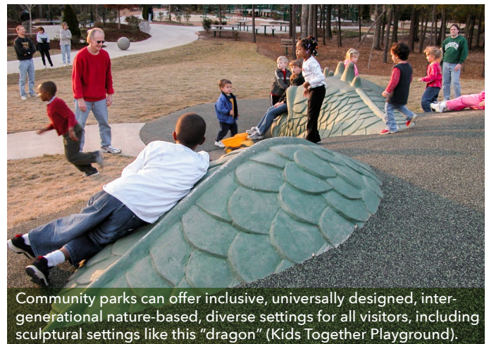
Community parks can offer inclusive, universally designed, inter-generational nature-based, diverse settings for all visitors, including sculptural settings like this “dragon” (Kids Together Playground).

Prevention ( CDC ) COVID-19 guidance for children, states that “indoor spaces are more risky than outdoor spaces.” The AAP further advises that “utilizing outdoor spaces” is one of the high-priority strategies for reducing the spread of COVID-19 in pre-kindergarten settings.