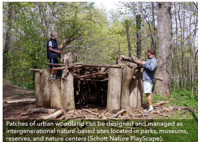
Patches of urban woodland can be designed and managed as intergenerational nature-based sites located in parks, museums, reserves, and nature centers (Schott Nature PlayScape).