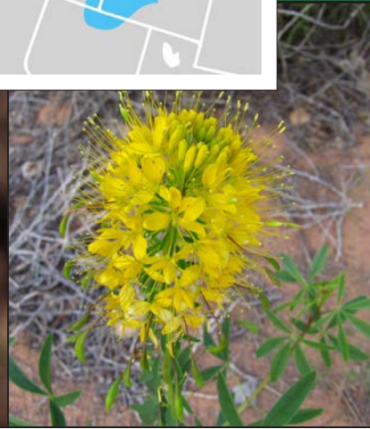
Left to right: Monarch on showy milkweed, cobwebby thistle, and yellow spiderflower.

The Inland Northwest encompasses much of eastern Oregon and Washington stretching from the eastern slopes of the Cascades into parts of western Idaho and northern Nevada. The landscapes in this region are dominated by shrub steppe and open prairie interspersed with juniper woodlands and pine forests. Nectar-rich shrubs and forbs take on special importance in this often arid landscape and are critically important resources for a number of insects and other wildlife, including breeding and migrating monarch butterflies.