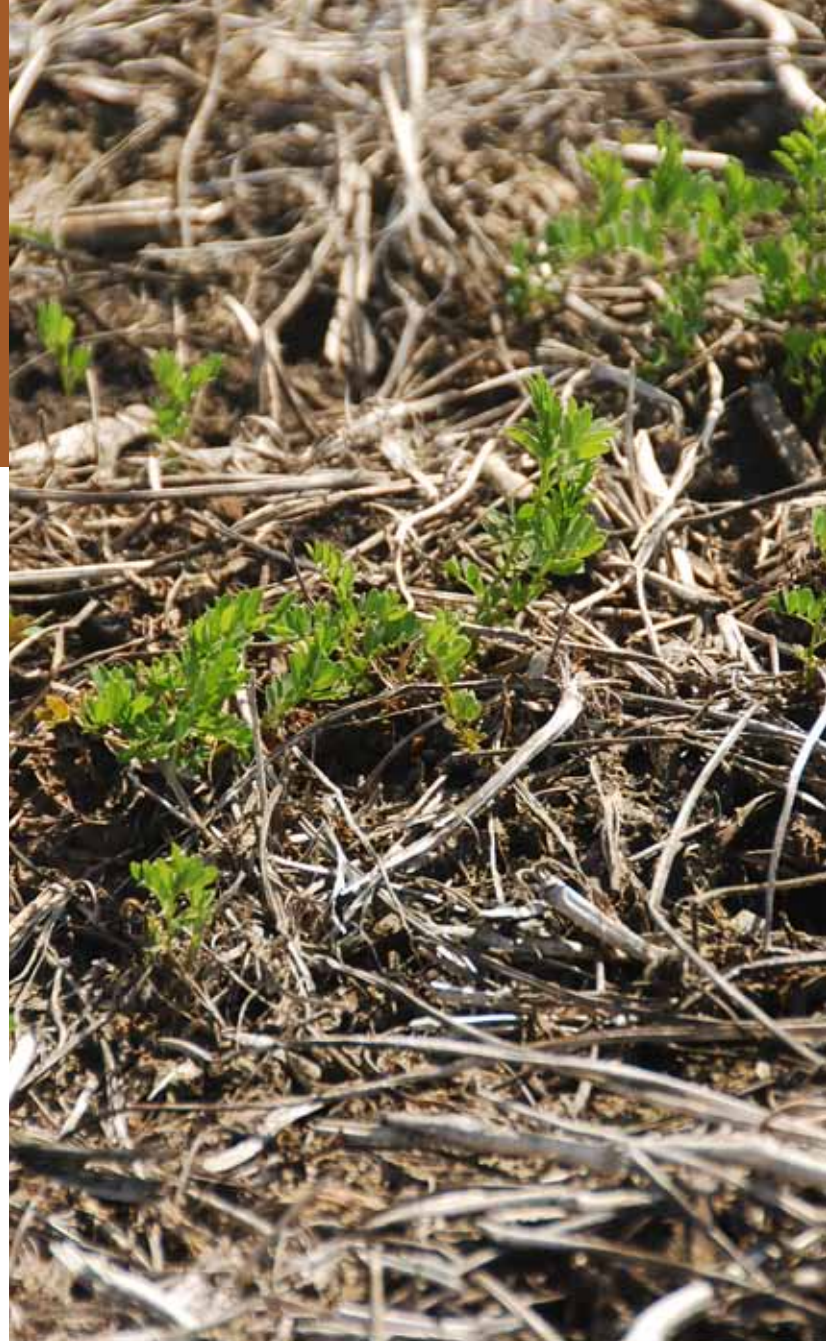
Austrian winter pea.

Widespread adoption of cover crops in the MRB would help keep nutrients and sediments on farms, improving water quality and ultimately benefitting not only farmers but the municipalities and industries that rely on the rivers and the gulf.