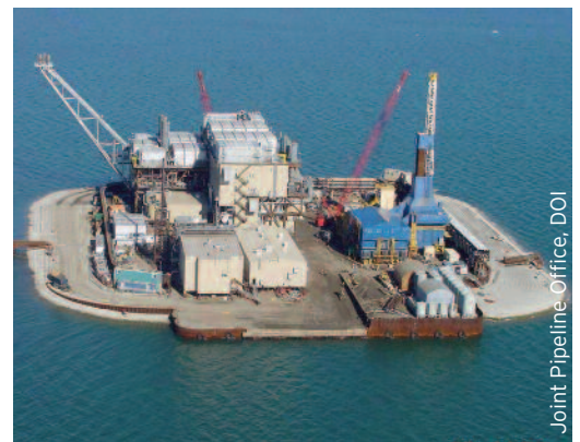
Joint Pipeline Office, DOI

Paradoxically, the agency charged with protecting polar bears is the same one putting bears at risk. Two huge offshore areas that overlap with proposed polar bear critical habitat have been designated by the Department of the Interior for oil and gas development. The Chukchi Sea and Beaufort Sea Planning Areas are 40 million and 33